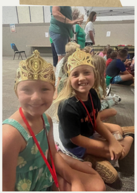
GRACE + HARPER