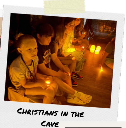
CHRISTIANS IN THE CAVE